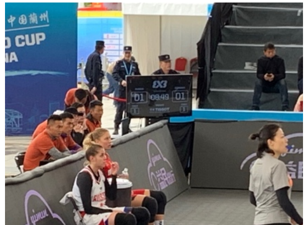
2: Example of seating area