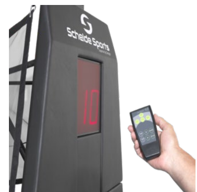
1: Example of Shot Clock