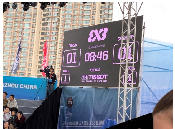
3: Example of LED Screen